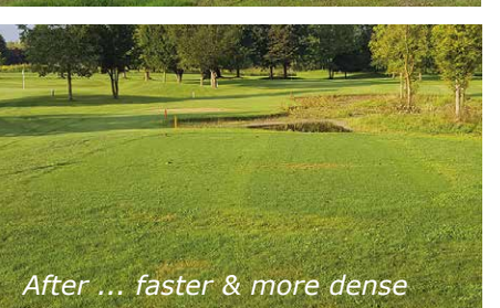
Aerification holes filled with 200g/m<sup>2</sup> VEGANOSOL